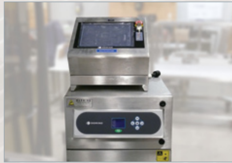
5. Two opposing laser heads