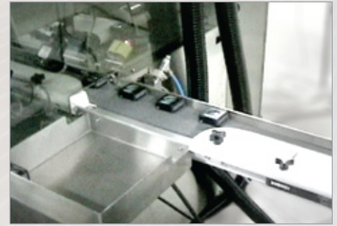
3. Vision inspection and reject