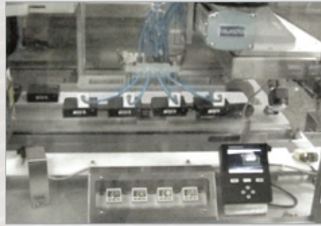
2. Discharge pick and place