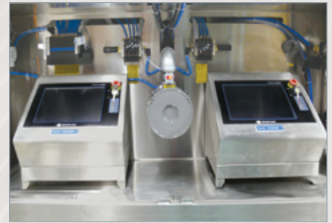
6. Optional laser controller location